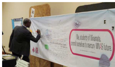
An INC participant returning his message to the banner carrying many messages written by the junior high school students of Minamata