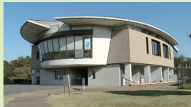
Kumamoto Prefectural Environmental Center Provision of opportunities to learn about various environmental issues