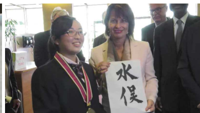
Goodwill ambassador to the Minamata Convention (a high school student) handing over a work of shodo calligraphy that reads "Minamata" to the President of Switzerland