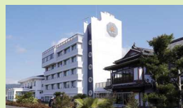
Umi-to-Yuyake at Yunoko Meeting space, accommodation