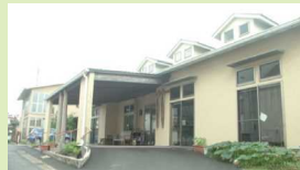
Hotto Hausu Workspace for Minamata disease patients