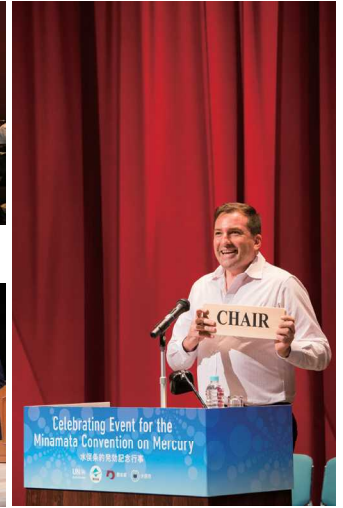
INC Chair participating in the Celebrating Event for the Minamata Convention on Mercury