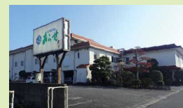
Event Hall Arase Meeting rooms, reception facility