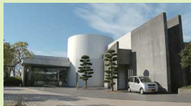
Minamata Disease Municipal Museum Preservation and display of valuable documents and materials related to Minamata disease