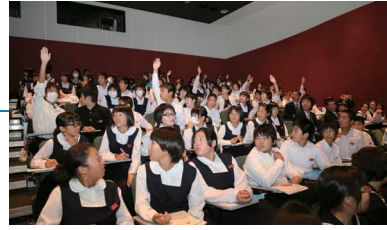
Participants of the 1st Anniversary Forum for the Adoption of the Minamata Convention on Mercury

Since the adoption of the Minamata Convention, Ministry of the Environment, Kumamoto Prefecture and Minamata City have co-organized events in Minamata. Events commemorating the adoption were held every October with local junior high school students until its entry into force, and another event commemorating the entry into force in 2017 with international participants. The events ‘Commemorative Fora for the Minamata Convention’ continue to inform residents about various activities related to the Minamata Convention in collaboration with Minamata City Education Board, Minamata High School, and other entities.