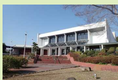
Minamata City Cultural Hall Main hall (1000 seats)