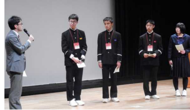
Junior high school students introducing one of the mercury management technologies in collaboration with the technology holder company