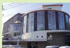
Moyai Hall Hall, meeting rooms