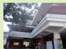
Minamata City Community Center Hall, meeting rooms