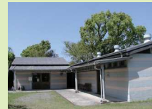
Minamata Disease Museum - Soshisha Display of lawsuit-related materials and information