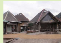
Minamata Kugino Airinkan Facility for village promotion based on ecology