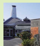
Orange Hall Hall, meeting rooms