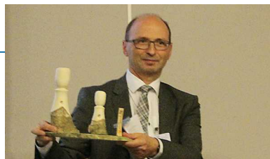
COP Chair receiving a pair of kokeshi dolls of prayer crafted by a Minamata disease patient

Notes) COP: Conference of the Parties to the Minamata Convention, INC: Intergovernmental Negotiating Committee