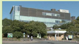
Minamata Disease Archives Research, academic exchange, and preservation of materials on Minamata Disease